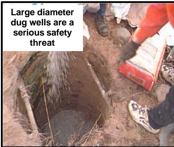
Large diameter dug wells are a serious safety threat

*Clean, dry soil backfill may be loam, clay, silt, or sand obtained from commercial sources or from the site. Clean backfill may not contain trash, wood, roots, sod, construction debris, or chemical contaminants.