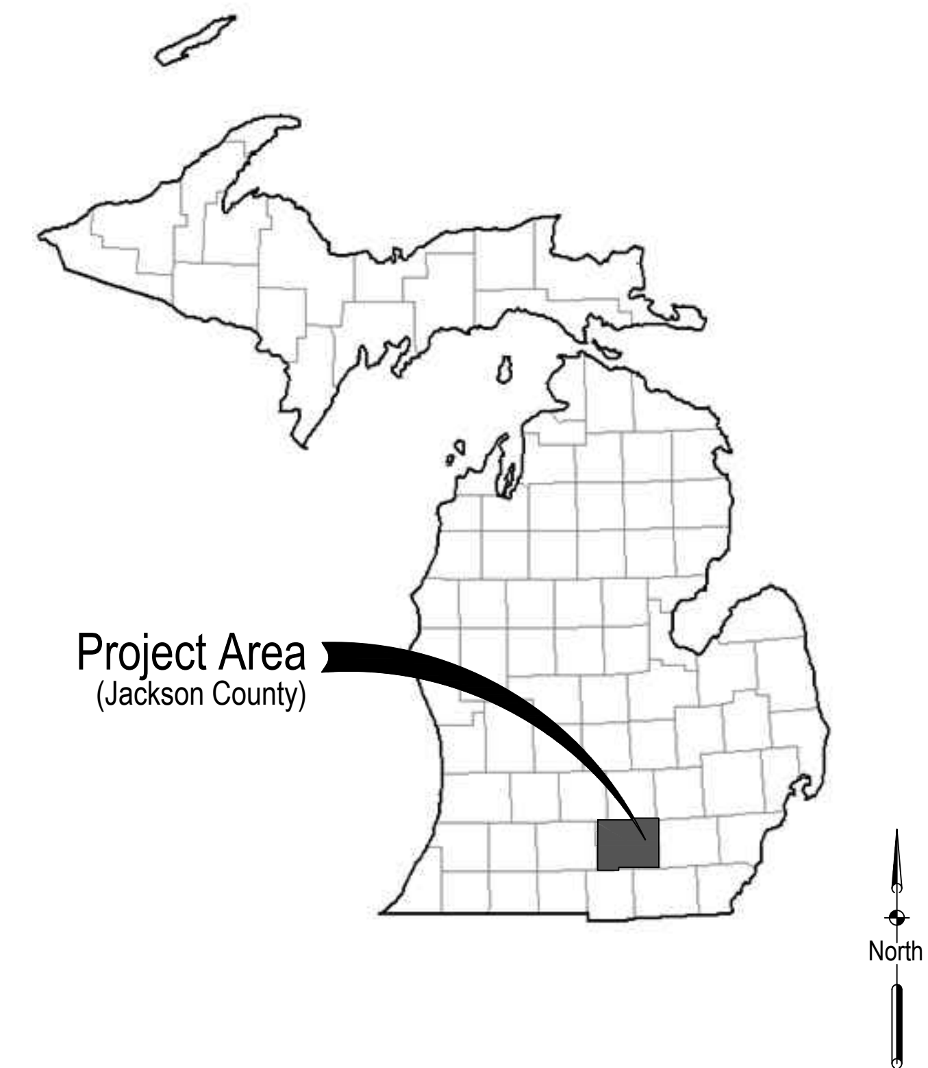
PROJECT VICINITY MAP

SmithGroup Project Number: 15174 ARPA-0622